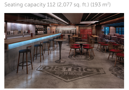
The District Brew House

Go a little wild with rockin' live music, accompanied by specialty cocktails and a variety of craft beers.