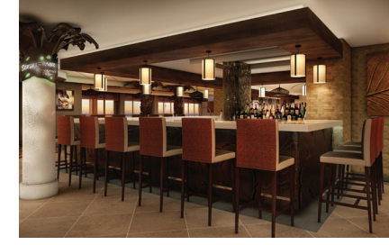
Sugarcane Mojito Bar

Enjoy a refreshing mojito with friends — day or night. Seating capacity 15