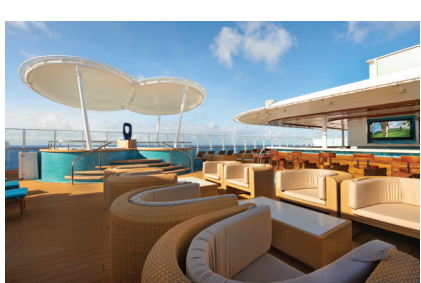
Vibe Beach Club

An adults-only private retreat with stunning views, oversized hot tub and full-service bar. Seating capacity 111 (5,229 sq. ft.) (486 m²)