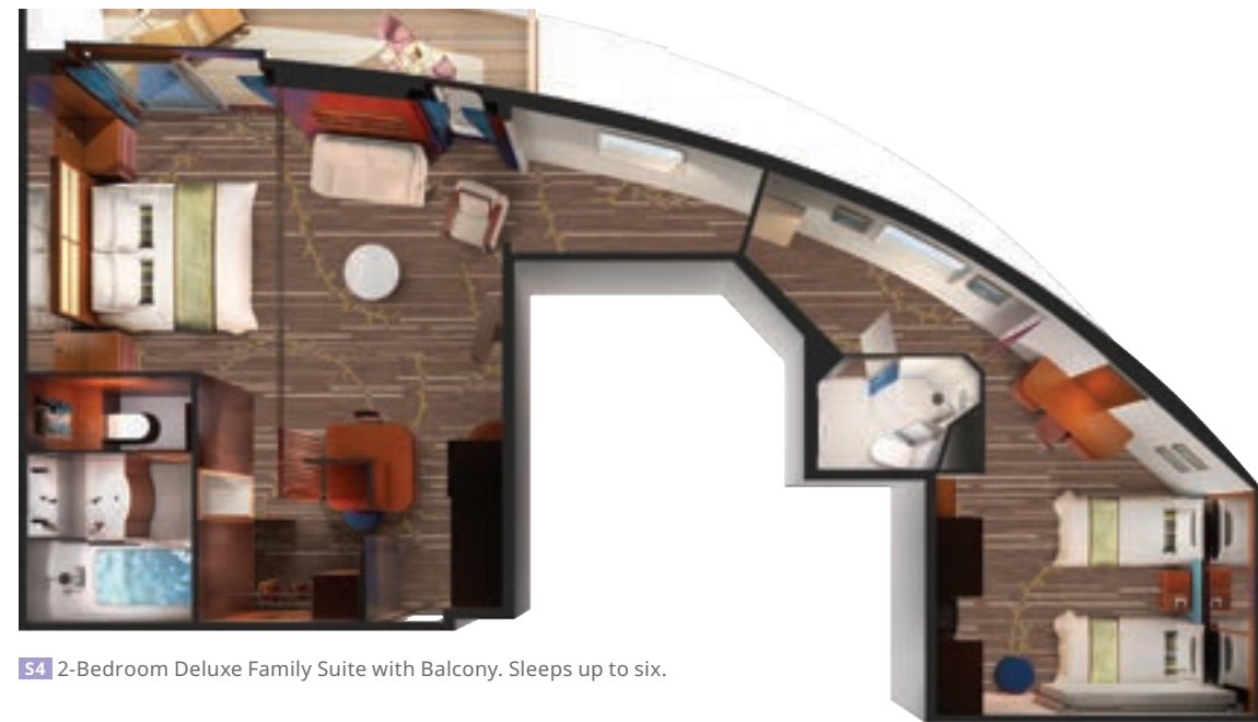
S4 2-Bedroom Deluxe Family Suite with Balcony. Sleeps up to six.