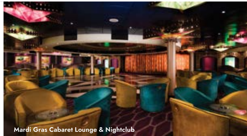
Mardi Gras Cabaret Lounge & Nightclub