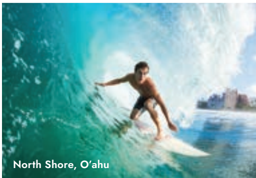
North Shore, O'ahu