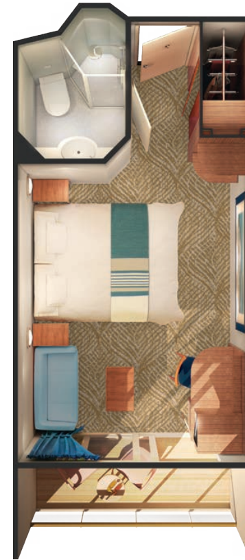
BB Balcony. Sleeps up to three.