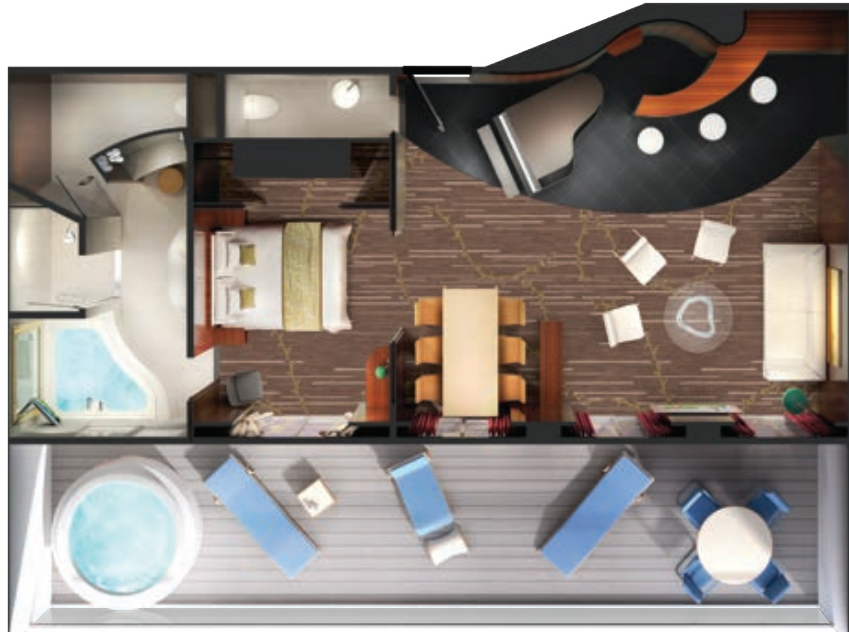
S5 Owner's Suite with Large Balcony. Sleeps up to four.