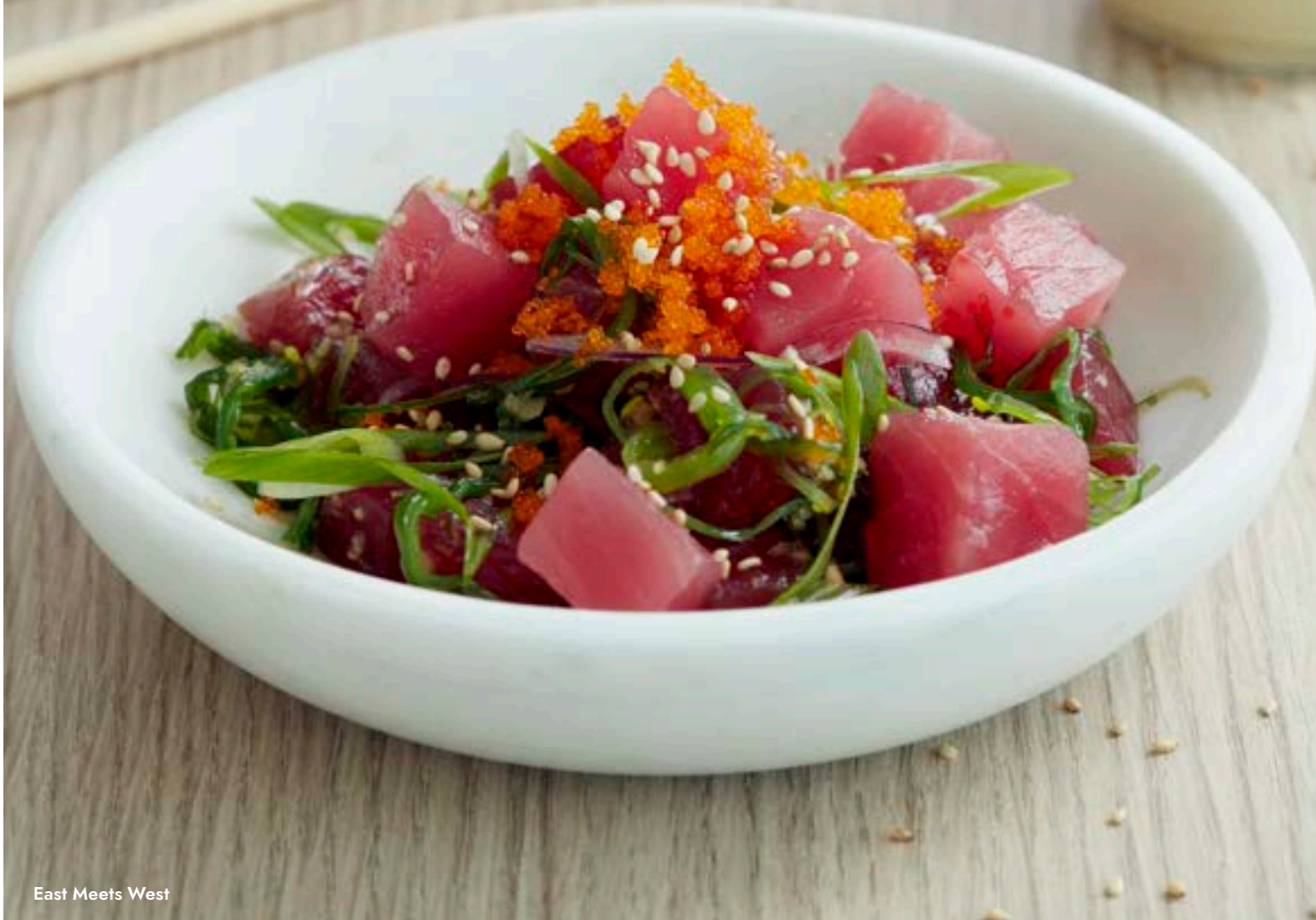
East Meets West

Dine how you want. When you want. And if your group prefers to start with dessert, we won't stand in their way. With no fixed dining times or pre-assigned seating, nobody does dining like Norwegian. Pride of America offers 19 different dining options, ranging from fine to fun. We can please even the pickiest of foodies with flavors from around the world. So unfold your napkin and enjoy experiences of gastronomic proportions.