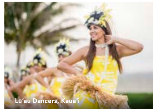
Lū'au Dancers, Kaua'i