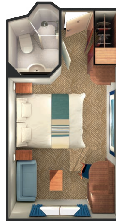
OA Oceanview With Picture Window. Sleeps up to three.