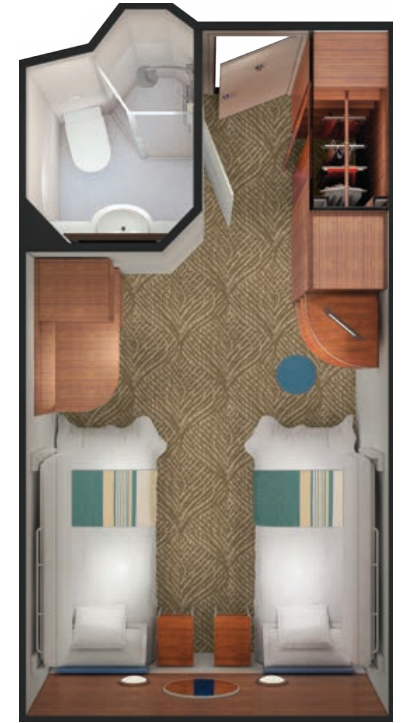
IA Inside. Sleeps up to four.