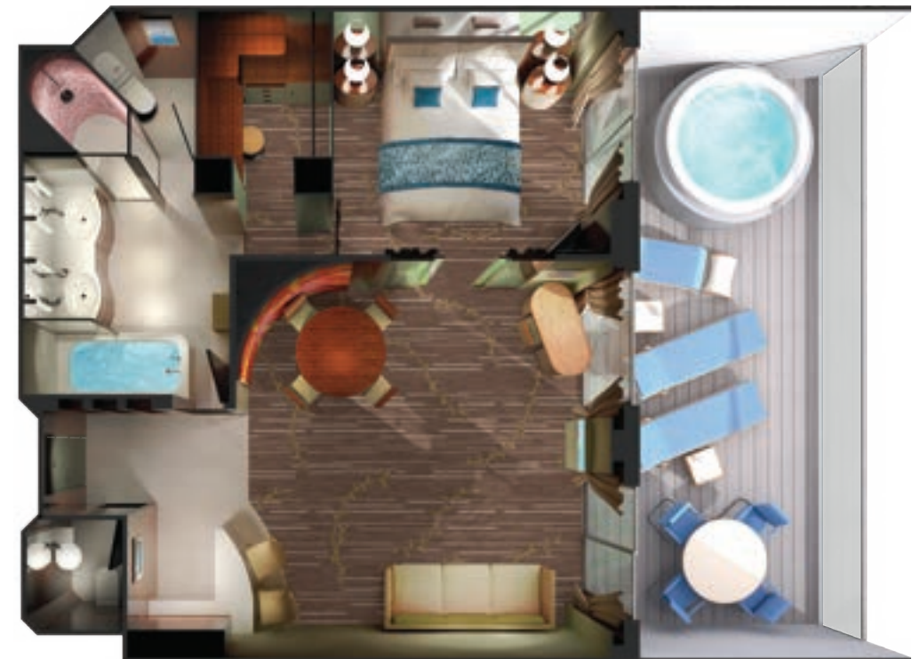
S8 Owner's Suite with Large Balcony. Sleeps up to four.