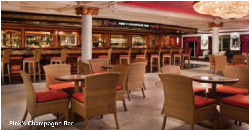
Pink's Champagne Bar

Please note that venues and capacity information are subject to change. Restaurant group availability varies by venue and time.