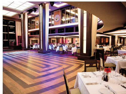
The Manhattan Room

You'll feel like you're in a private New York City supper club, thanks to panoramic ocean views from the two-story, floor-to-ceiling windows. And it's the perfect venue to see the special cabaret performances from Legends in Concert and their world's greatest impersonators. Seating capacity 594 (12,912 sq. ft.) (1,200 m 2 )