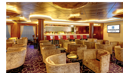
Shaker's Martini Bar

Shaken or stirred, happy hour always lives up to its name. Seating capacity 70 (1,969 sq. ft.) (183 m 2 )