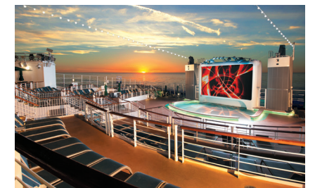
Spice H 2 O

An adults-only sultry, Ibiza-inspired beach club at the back of the ship. Seating capacity 170 (9,759 sq. ft.) (907 m 2 )