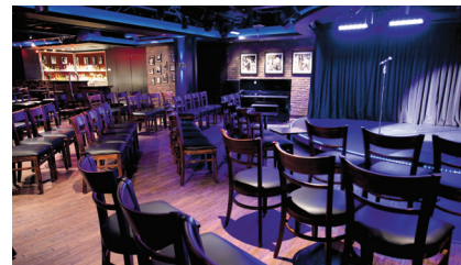
Headliners Comedy Club

Your sides will definitely ache after a night at Headliners Comedy Club thanks to the comedic stylings of Levity Entertainment Group. Employing over 300 artists nationwide, Levity is the largest producer of live comedy, creating tours and TV specials for the biggest names in the industry, including Daniel Tosh, Amy Shumer, Gabriel Iglesias, Jeff Dunham and more. Enjoy the hysterical musings of Levity's best and brightest with 12 hilarious shows per week. Hope your funny bone isn't that ticklish. Seating capacity 271.