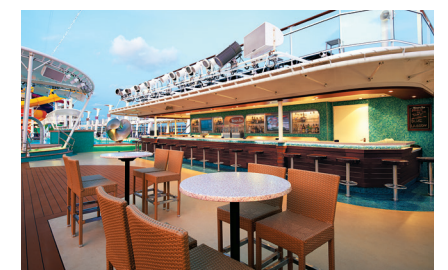
Waves Pool Bar

Relax in a lounge chair, frozen drink in hand, and not a worry in the world. Seating capacity 129