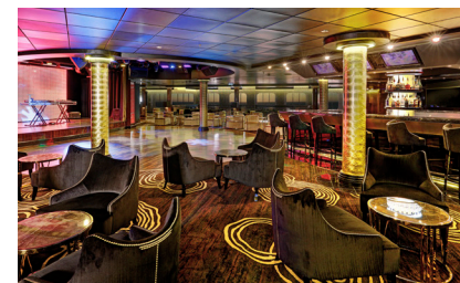
Bliss Ultra Lounge

Three mood-lit bowling alleys, nonstop music, plasma screens and plenty of partying. Seating capacity 310 (7,801 sq. ft.) (725 m 2 )