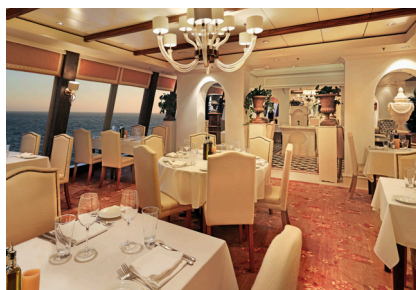
La Cucina Italian Restaurant

Traditional Italian meals are served with a modern twist. Seating capacity 182 (3,831 sq. ft.) (356 m 2 )