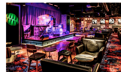
The Cavern Club

Step inside a recreation of the legendary Liverpool club where the Beatles performed. Listen to the tunes of a Beatles cover band and other live musical acts. Seating capacity 93 (2,313 sq. ft.) (215 m 2 )