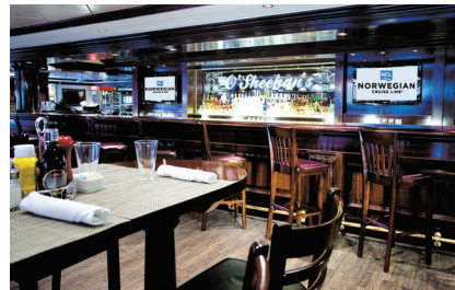
O'Sheehan's Neighborhood Bar & Grill

This place is so inviting everyone here really may eventually know your name. Dine on American classics like chicken wings and meatloaf, as well as your favorite comfort foods, including fish and chips, burgers and more, all served 24 hours a day. Seating capacity 269 (5,305 sq. ft.) (493 m 2 )