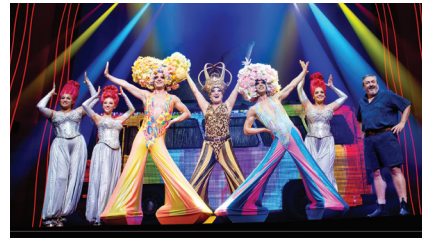
Priscilla, Queen of the Desert — The Musical

Hop on a battered bus for the most fabulous road trip at sea. Based on the Oscar-winning movie, Priscilla, Queen of the Desert — The Musical is the heart-warming, uplifting comedy adventure of three friends searching for love and friendship and features a string of dance-floor favorites, including "It's Raining Men," "I Will Survive" and "Girls Just Wanna Have Fun."